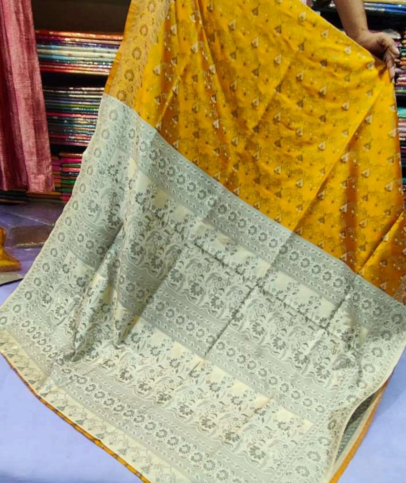
Jamdani banarasi saree