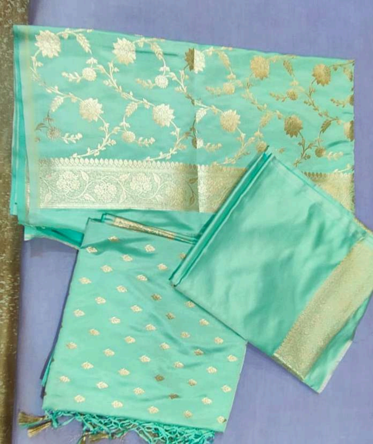
Jari Work Pure Silk 3 Piece Suit Cloth