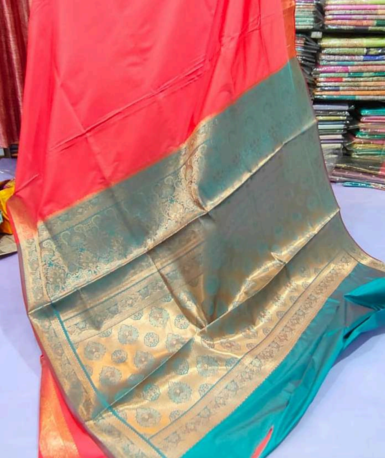
Banarasi silk plain saree