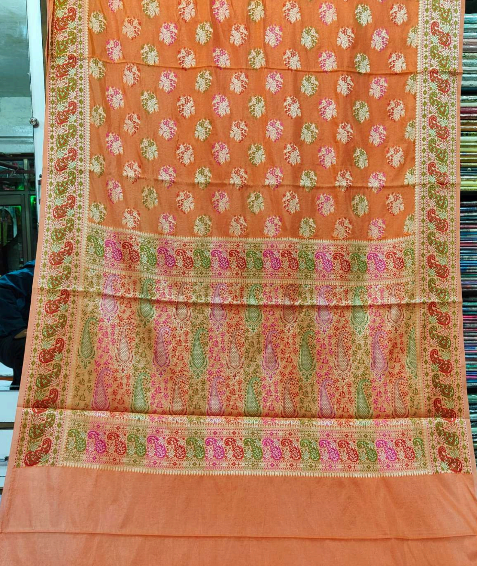
Minjari multicolor saree