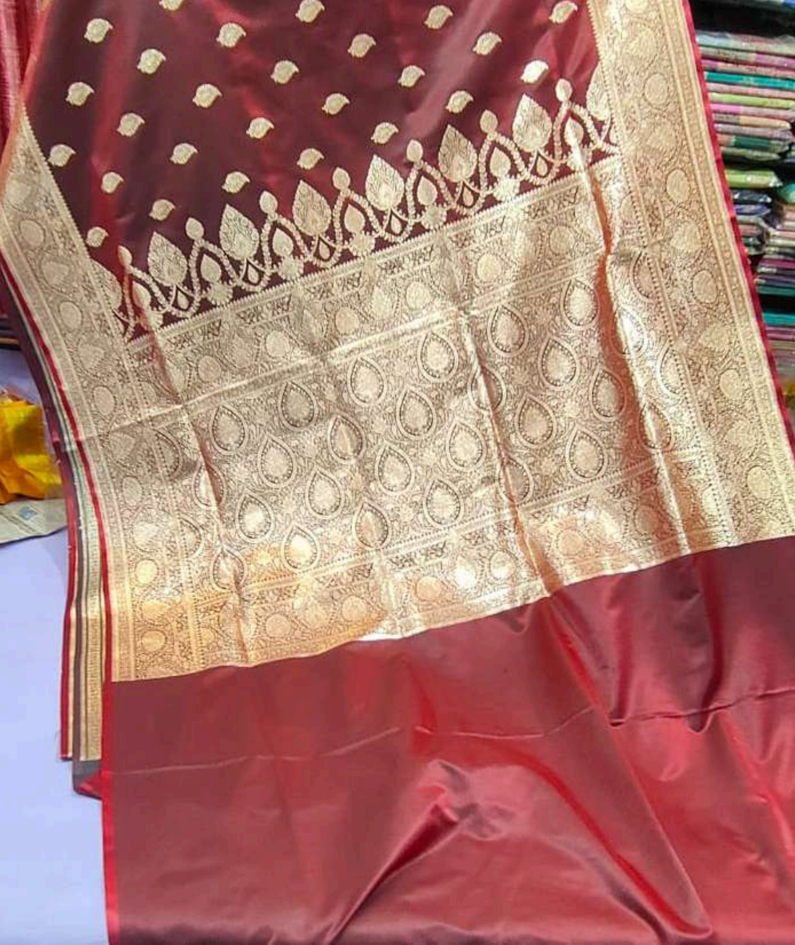
Banarasi silk saree