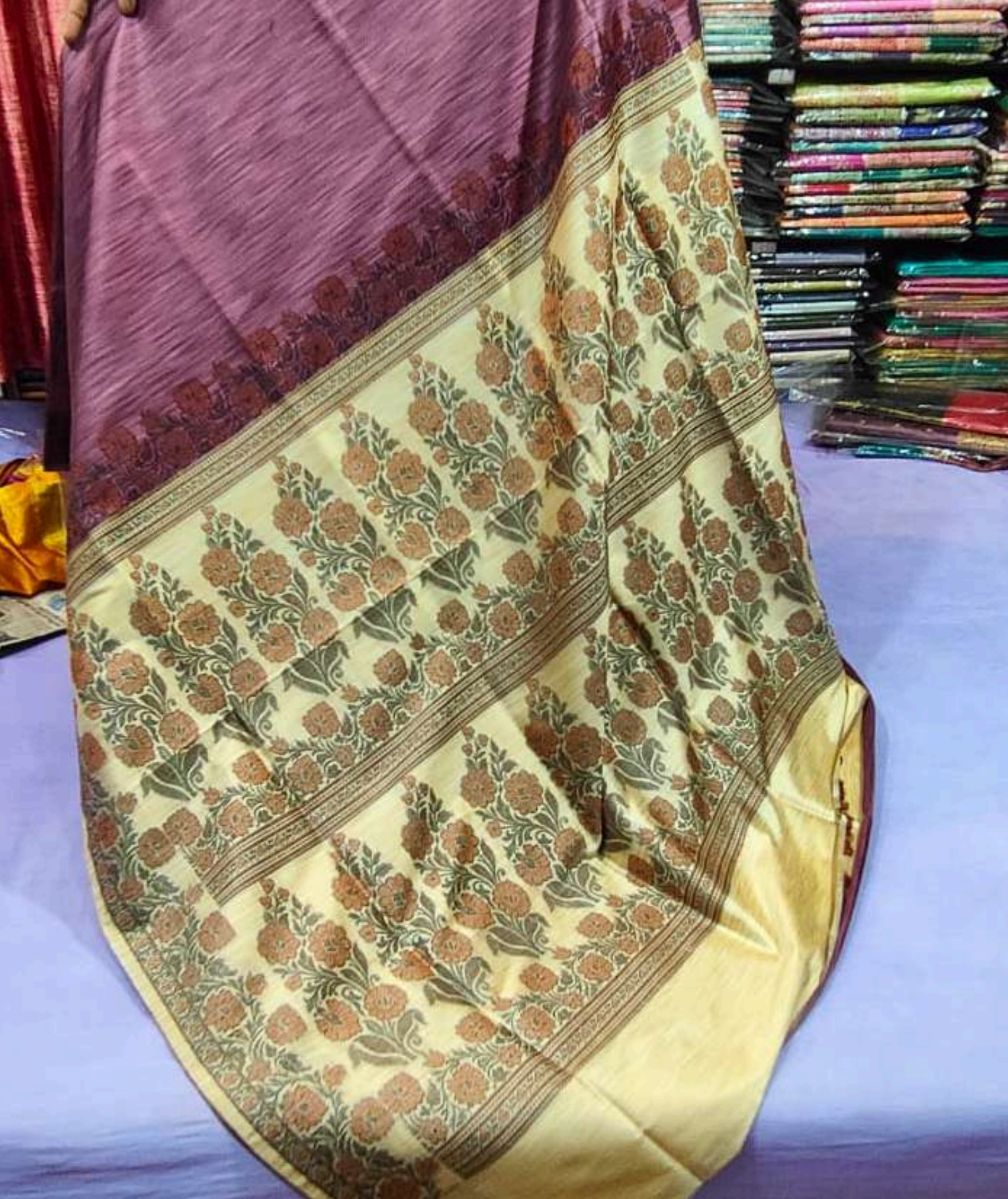
Khaadi silk Saree