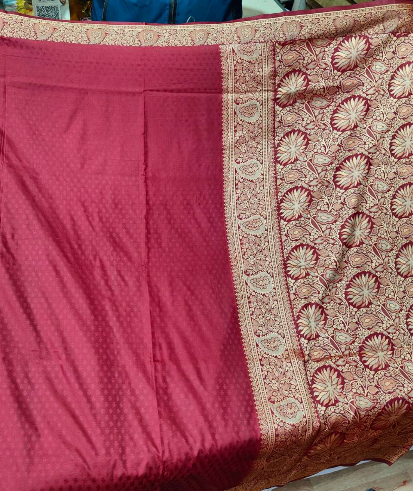
Tanchuyi work silk saree